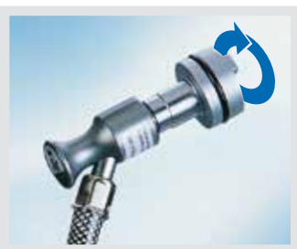
Gas probe NF for compressed air (NF S 90-116) – ISO colour coding

Gas probes for worldwide application: Due to a broad range of gas probes with standardized connection forms (MEDAP, DIN, BS, NF, SS, UNI), MEDAP connection tubes can be used worldwide for direct extraction from the central gas supply system. In addition to high safety technology the gas probes distinguish themselves by comfortable handling. So the DIN, BS, NF and SS gas probes are equipped with rotating connection axles. This means that the connection tube moves freely on the gas probe und may thus be positioned individually.