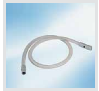
Connection tube for anaesthetic gas scavenging systems with shunt air opening