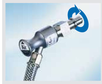
Gas probe DIN for compressed air – ISO colour coding