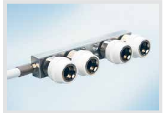
Distributor for gases DIN 13260 with four gas outlets for oxygen

Gas distributor for DIN 13260: They are suitable for compressed air and oxygen gas types and are equipped with 2 or 4 terminal units. An integrated pressure tube in 1.5 m length in ISO colour coding with DIN gas probe is included in the scope of delivery. An equipment holder with fixing screw for fastening to the 25 x 10 mm equipment rail (DIN) (Art.-No. 5752 4532) must be ordered separately.