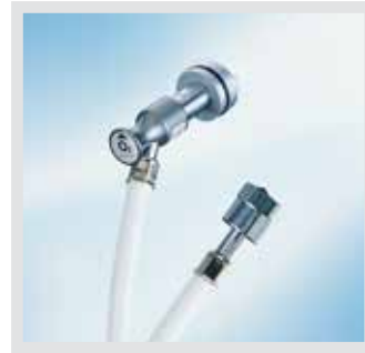
Connection tube oxygen with NF gas probe and NIST screw connector – neutral colour