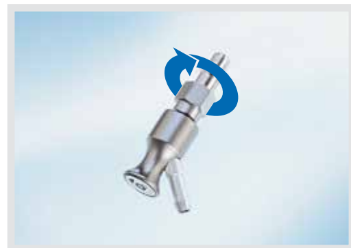
Gas probes oxygen with tube connecting piece for gas outlets according to DIN 13260