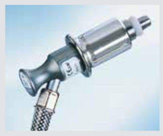
Gas probe MEDAP for compressed air – ISO colour coding