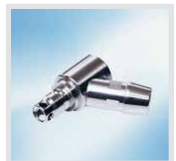
Gas probe for anaesthetic gas scavenging systems AGSS-EN, type 1