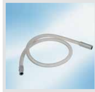
Connection tube for anaesthetic gas scavenging system without shunt air opening

Top quality finish: For the safety of patient and hospital staff MEDAP gas probes and connection tubes for anaesthetic gas scavenging systems are made of material which more than meets the highest OR quality requirements.