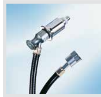
Connection tube compressed air with MEDAP gas probe and NIST screw connector - neutral colour