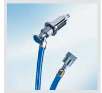
Connection tube laughing gas with MEDAP gas probe and NIST screw connector – ISO colour coding