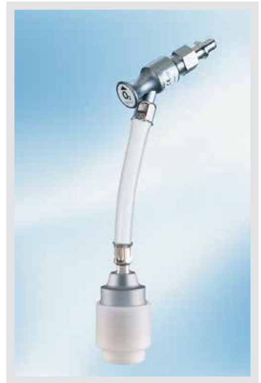
Oxygen adapter coupling with DIN gas probe and MEDAP coupling – ISO colour coding