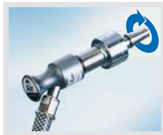
Gas probe BS for compressed air (BS 5682) – ISO colour coding