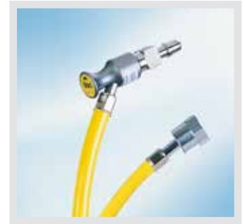
Connection tube vacuum with DIN gas probe and NIST screw connector - ISO colour coding