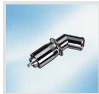
Gas probe for anaesthetic gas scavenging systems AGSS-C