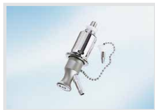
Gas probes oxygen with tube connecting piece for MEDAP gas outlets