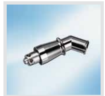
Gas probe for anaesthetic gas scavenging systems AGSS-E