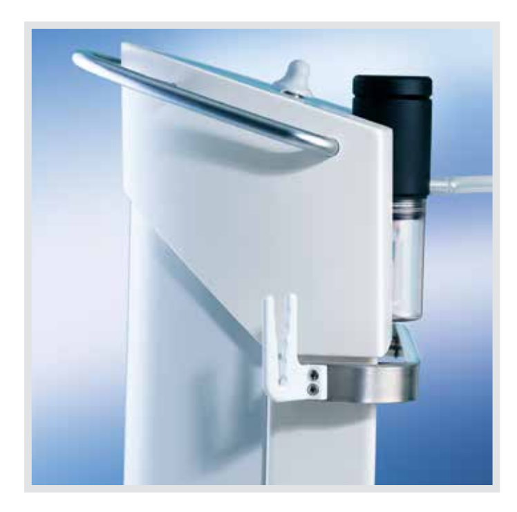
The side view shows the handle which is accessible from all sides, the ergonomic vacuum controller and the equipment rail with cable holder.

Focus on electrical safety: In order to ensure that electrical energy only flows where it is supposed to, the TWISTA SP 1070 has a connection for equipotential bonding – to protect the patients against overvoltage. This is an important criterion, for example, for use in heart surgery. Further accessories such as plastic cap plugs enhance protection against electrical leaks.