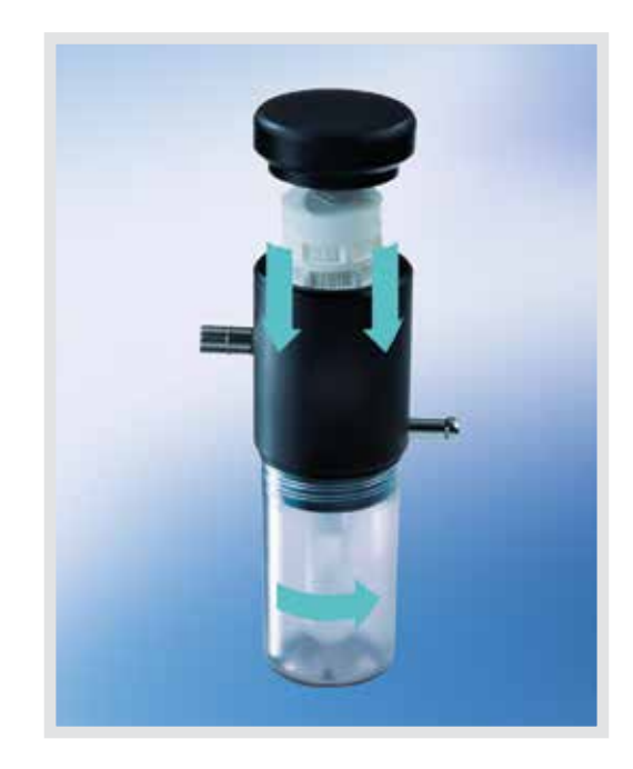
Overflow protection system with mechanical overflow protection in the lower part and chamber for hydrophobic bacterial and viral filter in the upper part of the overflow protection system

All of the components of the overflow protection system are part of an economical re-usable system and can be autoclaved at 134 °C. A precondition of this is, however, that the autoclavable hydrophobic bacterial and viral filter is not heavily soiled.