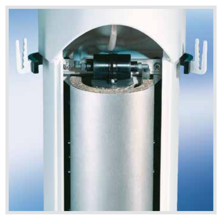
Maintenance-friendly, smooth running drive unit

Quality reduces operating costs: Like all ATMOS products, the TWISTA SP 1070 is distinguished by excellent workmanship, the use of high-quality materials and individual components, and a long life. The almost maintenance-free unit requires an initial, brief inspection after 3,000 hours of operation only. Maintenance work takes no more than one hour. This means: The TWISTA SP 1070 guarantees maximum performance – e.g. the vacuum is generated within a very short time – and minimum follow-up costs.