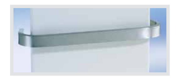
DIN equipment rail for attaching septic fluid jars

Double protection against contamination: In addition to the hydrophobic bacterial and viral filter for overflow protection, which is located at the entry of the surgical aspirator, the TWISTA SP 1070 is equipped with a high-performance bacterial filter at the air outlet and thus with double highly efficient protection against contamination. The innovative combination of the two filter systems avoids that bacteria and viruses enter OR air, particularly in critical situations. This guarantees the highest level of safety for patient and OR staff.