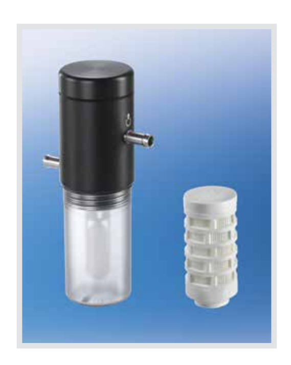
Overflow protection system with hydrophobic bacterial and viral filter