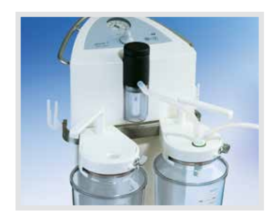
TWISTA SP 1070 with double overflow protection: Mechanical overflow protection and hydrophobic bacterial and viral filter