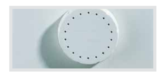
Bacterial filter at the air outlet