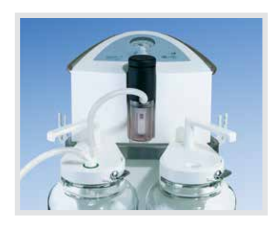
TWISTA SP 1070 with mechanical overflow protection system