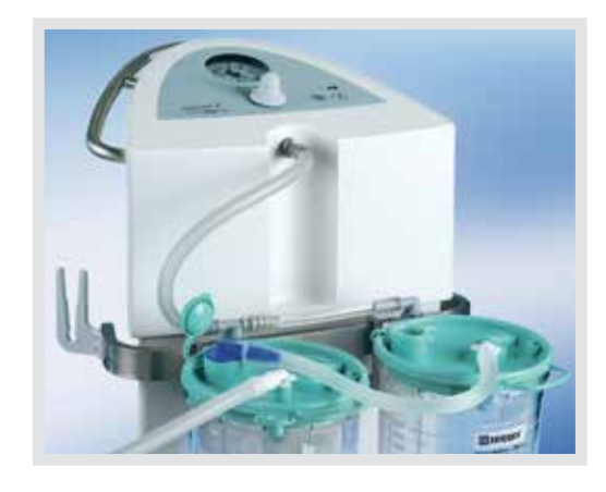
TWISTA SP 1070 basic version: Disposable suction liner with integrated hydrophobic filter for overflow protection